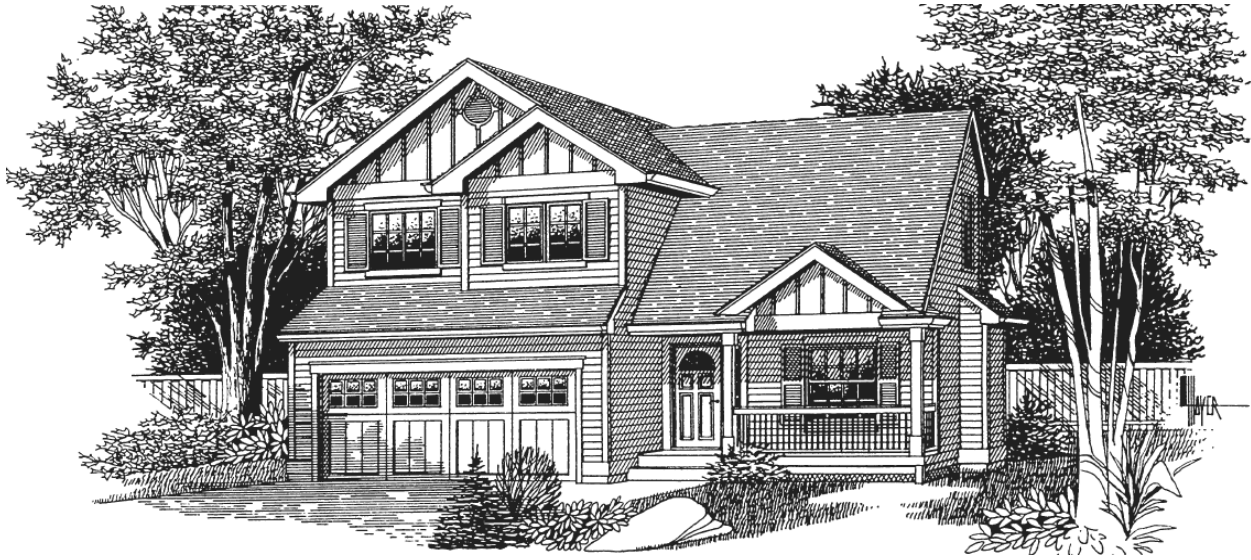
Highland B 1530 Square Feet